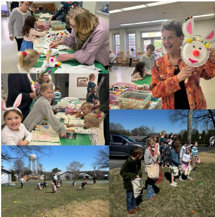
Easter Egg Hunt and crafts