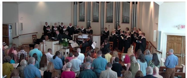
Easter Sunday Worship Service