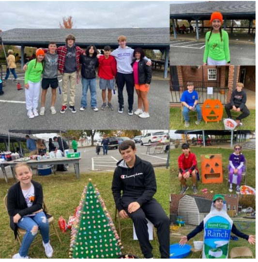
FROM LEFT: The Junior Youth went reverse Trick-Or-Treating at Priddy Manor; Senior High and Middle High youth groups volunteered at the KMP Halloween Carnival